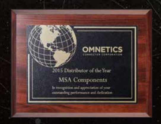
Omnetics Connector 2015 Distributor of the Year