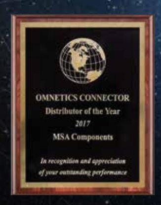
Omnetics Connector 2017 Distributor of the Year